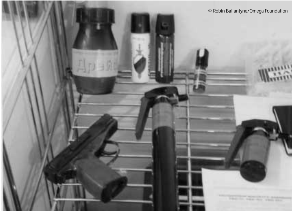
(Above) Electro-shock and chemical spray equipment on display at an arms fair in Russia, 1998.