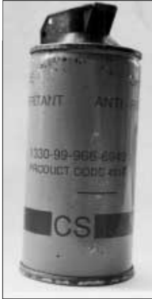
A tear gas grenade found in the UNIP offices, Zambia, 1997. Made in Britain

had been manufactured by a UK firm, Pains-Wessex, a subsidiary of Chemring plc. AI called on the UK government to suspend the export of tear gas weaponry to Zambia. However, on 21 July 2000, the UK government published its annual report on arms exports. The report showed that in 1999 the UK government had granted licences for the export of CS grenades and tear gas/irritant ammunition to Zambia. AI is continuing to press for the suspension of such transfers to Zambia until the Zambian police are made properly accountable and trained in the use of tear gas. AI is also trying to find out which company is responsible for exporting this equipment.