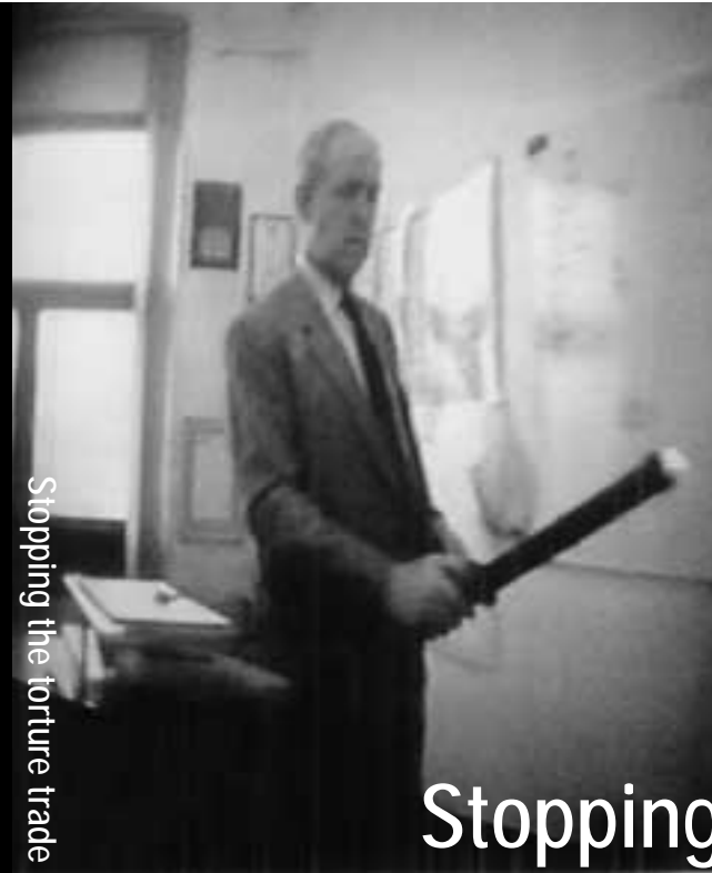
Stopping the torture trade

In October 2000 Amnesty International launched a worldwide campaign against torture, Take a step to stamp out torture . This report, which is released as part of the anti-torture campaign, aims to mobilize people around the world to put pressure on governments and on companies to stop the torture trade.