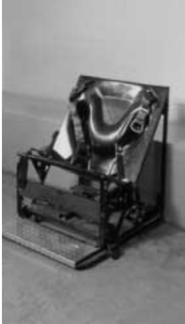
A restraint chair |

such device is the restraint chair, which allows a prisoner's wrists and ankles to be secured at the same time — known as four-point restraint. In addition straps can be tightened across the prisoner's shoulders and chest. The restraint chair has been marketed as a "safer alternative" to other forms of four-point restraint.