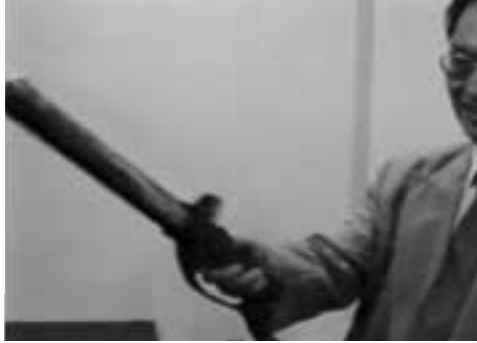
A salesman demonstrates an electro-shock baton at an arms fair in Taiwan, 1998.

weapons, with a Taiwanese company reportedly setting up manufacturing facilities in mainland China. In 1995 the managing director of a Scottish company, ICL Technical Plastics, admitted selling electro-shock