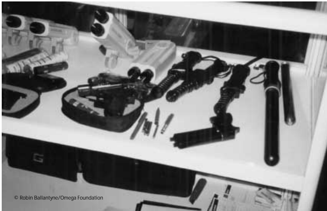
(Below) Electro-shock and tear gas weapons on display at an arms fair in South Africa, 1998.