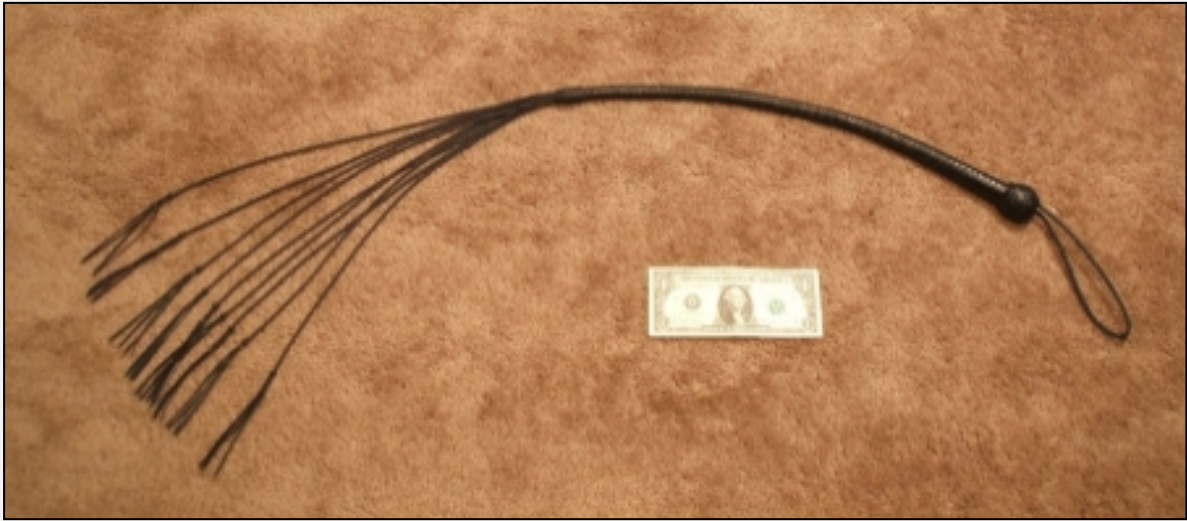
▲ Multiple lashed whip (Cat O' Nine Tails)