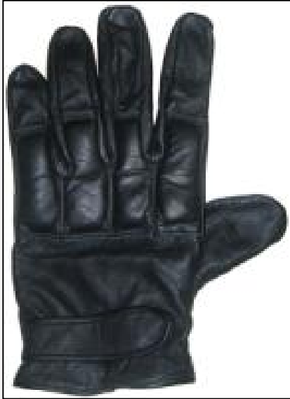
▲ Weighted glove