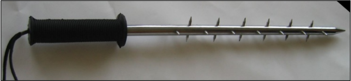
▲ Metal baton with spikes along length of shaft