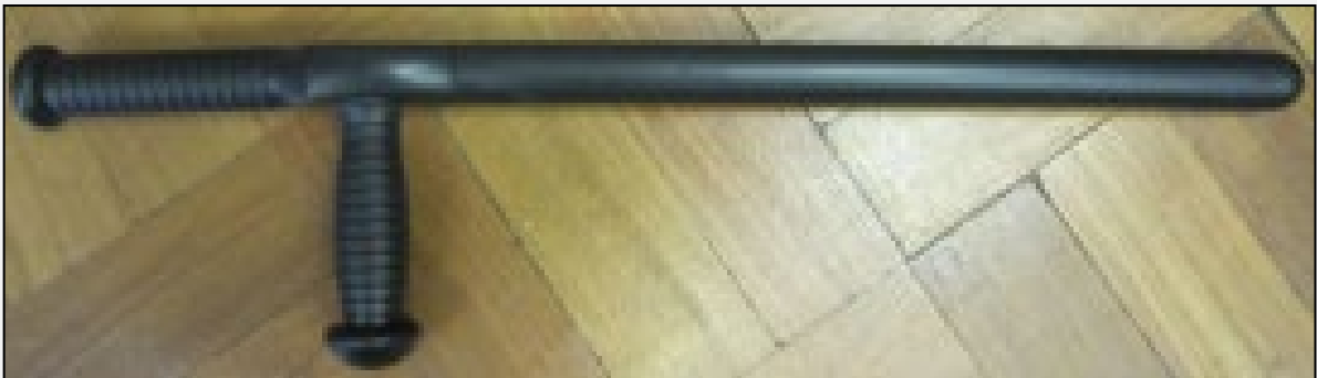
▲ Side-handle baton