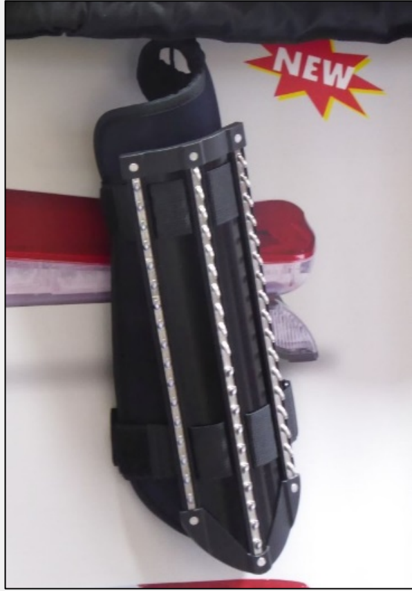
▲ Spiked body armour