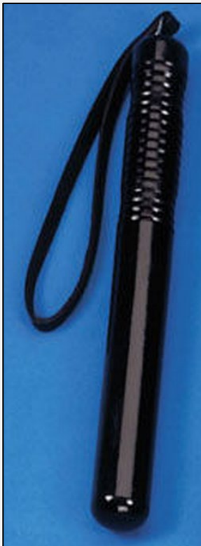
◀ Billy club