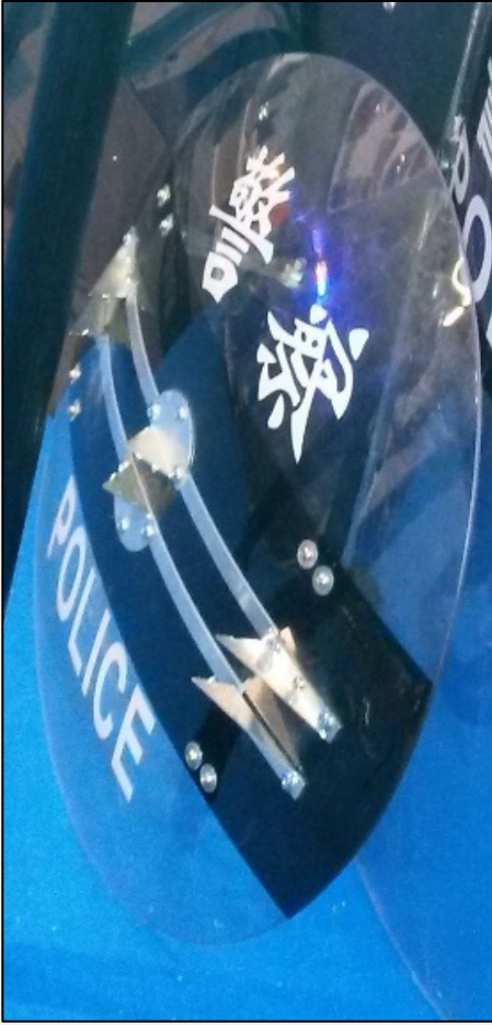
▲ Spiked shield