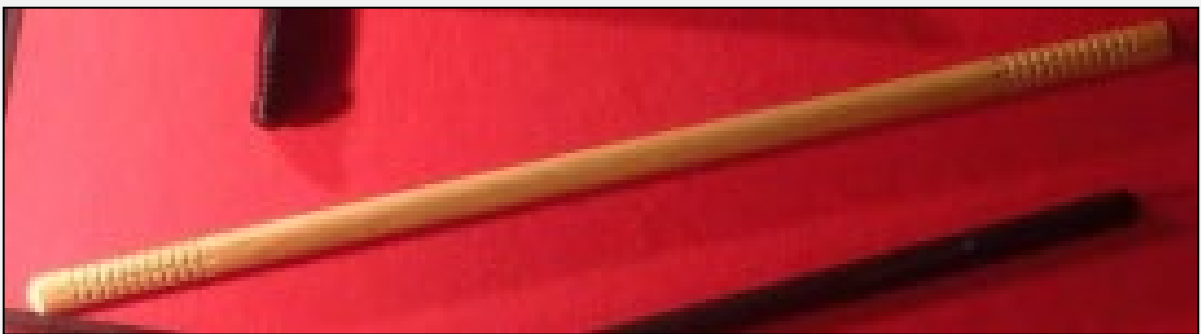
▲ Straight baton