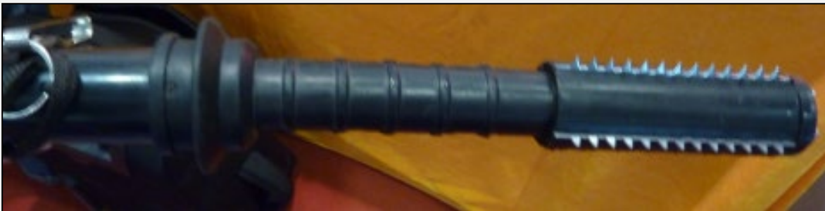
▲ Rubber baton with spikes at the head